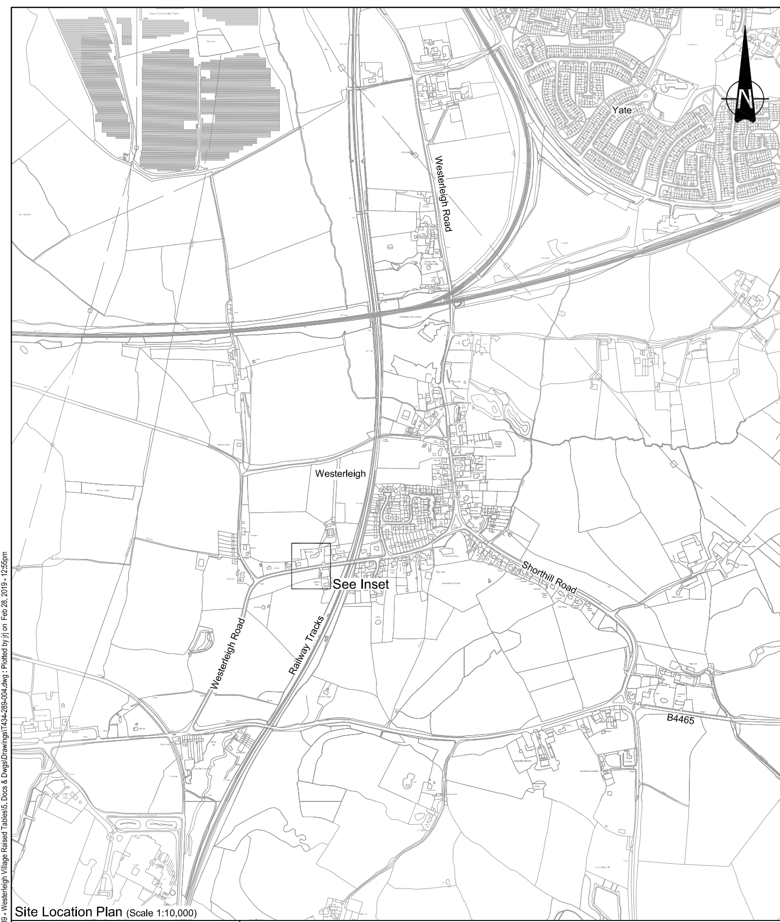
Site Location Plan (Scale 1:10,000)