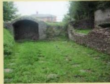
ARCHWAY & LOADING BAYS