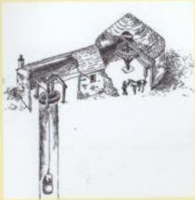
THE HORSE GIN