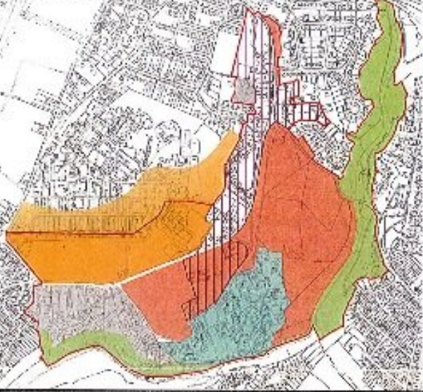
1A) Character Areas