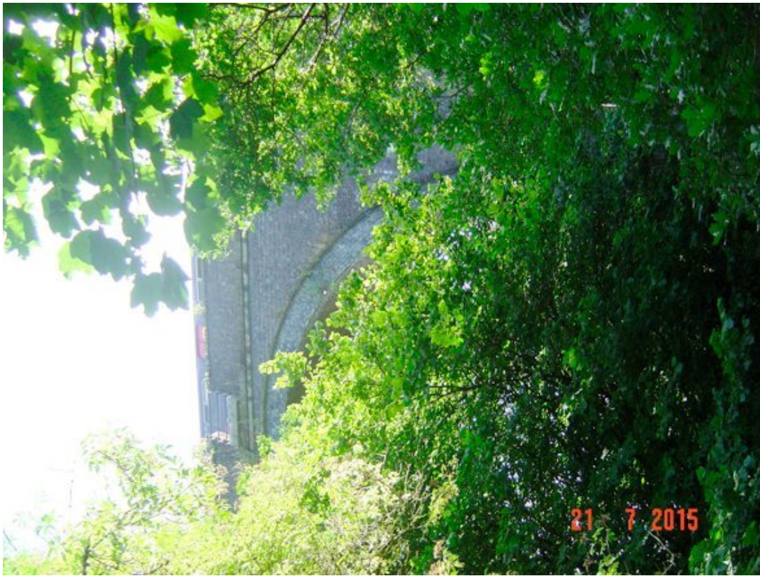
Typical views in the quarry area. Highly valued natural reserve